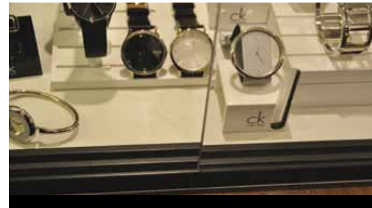
Display cabinet with sliding Hammerglass sheets